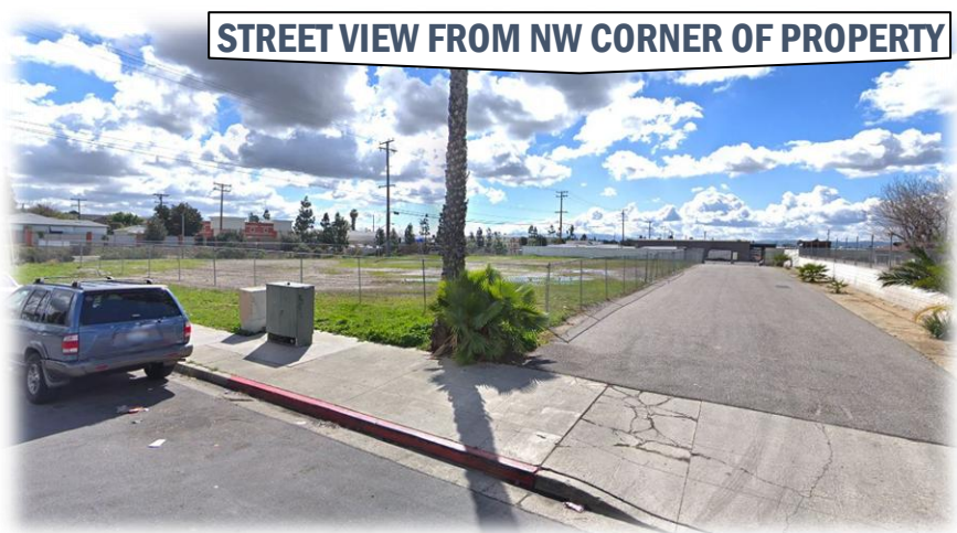
STREET VIEW FROM NW CORNER OF PROPERTY