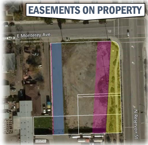
EASEMENTS ON PROPERTY