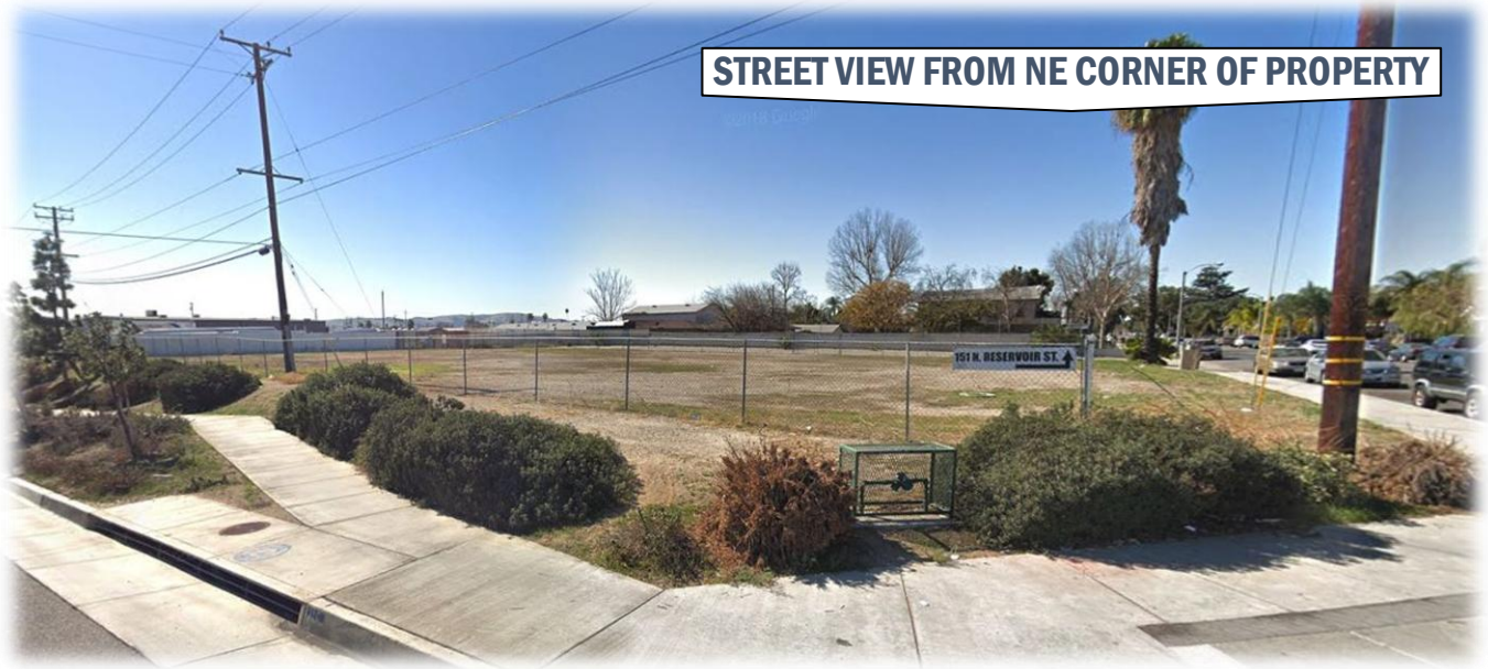
STREET VIEW FROM NE CORNER OF PROPERTY